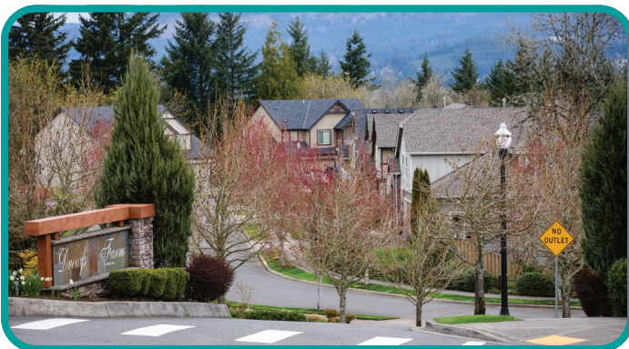
INSIDE: Learn how trade-ups are used in Camas, WA.

In communities that don't have codes requiring sprinklers in new construction, the fastest path to increased residential fire safety is to work with developers ahead of builds, offering something of value in exchange for installing fire sprinklers in all homes in new developments. Call them incentives or trade-ups – AHJs are increasingly using locally negotiated developer benefits to make their jurisdictions safer for all. You can too.